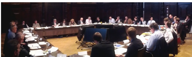
The Council and its Standing Committees held regular meetings