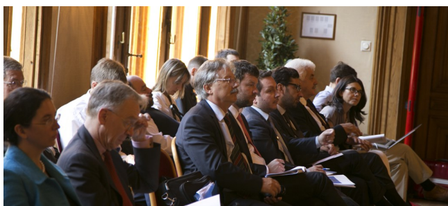
Fellows and Observers met at the General Assembly in Vienna