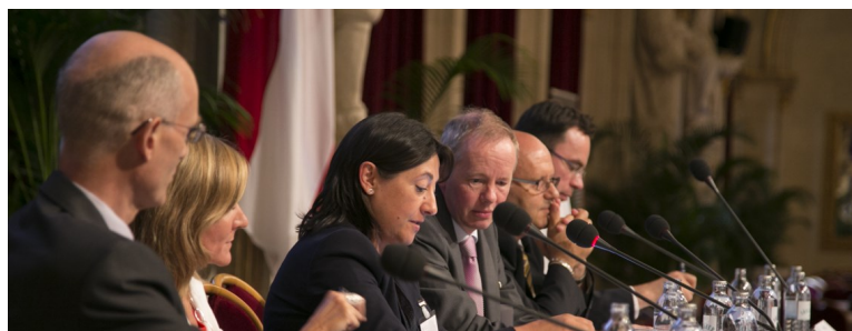
Three of the current projects were discussed at the 2013 Project Conference