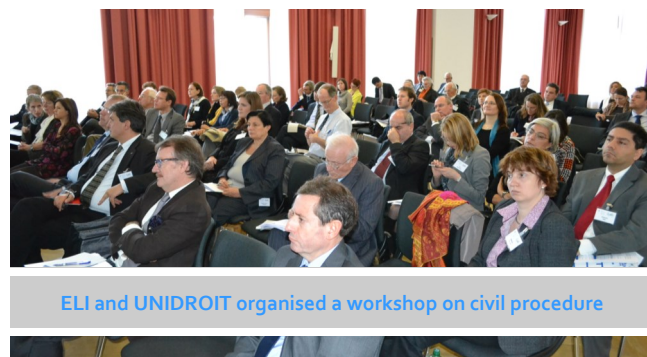
ELI and UNIDROIT organised a workshop on civil procedure