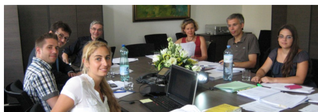
Numerous meetings of Project Teams were held