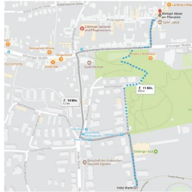
Walking route from 'Wien Hohe Warte' to the Heuriger