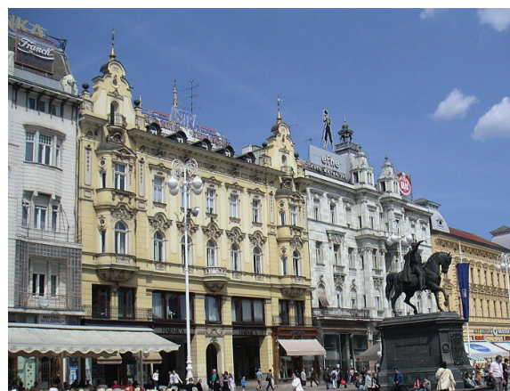
Trg bana Jelačića, Zagreb's main square

More details about the event will continue to be provided over the coming months, and registration will be open in the late spring. Please try to accommodate these dates in your diaries; this year's Conference promises to be of a very high calibre!