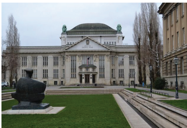
Hrvatski državni arhiv, Croatian State Archives

The venue for both the Conference and General Assembly will be the Croatian State Archives , a spectacular art nouveau building in the centre of Zagreb