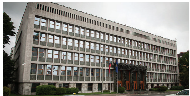
Slovenian Parliament Building, Ljubljana

The launch of a Slovenian Hub will mean that ELI hubs are active in five European countries: France, the UK, Austria, Germany and Slovenia.