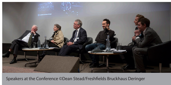
Speakers at the Conference

The ELI organised a Conference, with Freshfields Bruckhaus Deringer, which took place on 27 February 2018 in London (UK). The event focused on aspects of digitalisation in light of legal developments in the UK and its impact on European integration.