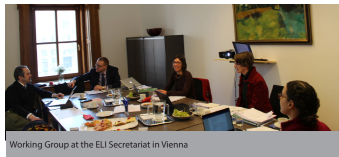
Working Group at the ELI Secretariat in Vienna

Find out more about this Project on our website here .