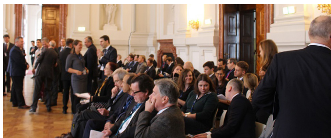
Guests in the Austrian Ministry of Justice