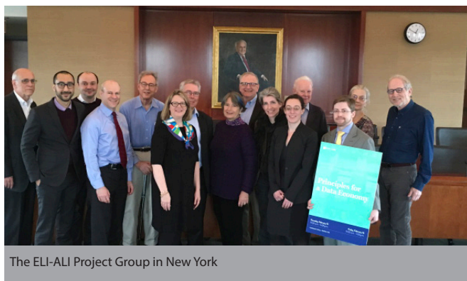
The ELI-ALI Project Group in New York

The Project aims to produce a set of transnational Principles that can facilitate the drafting of model agreements or provisions to be used on a voluntary basis by parties in the data economy. They can also be used as a source of inspiration and guidance for courts and legislators worldwide.