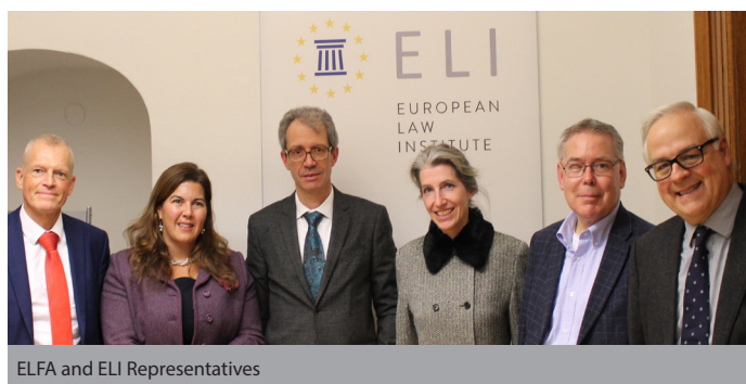
ELFA and ELI Representatives