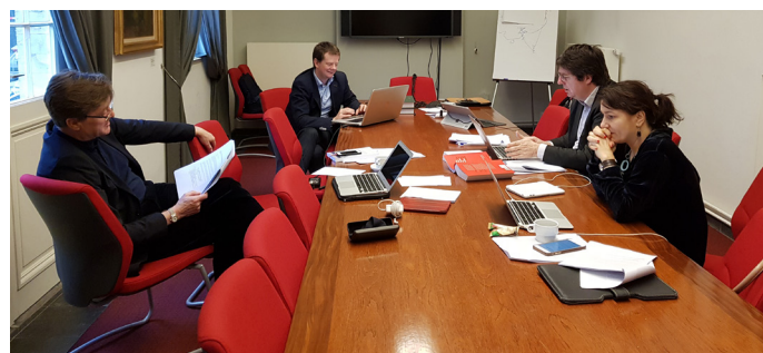
Members of the Working Group on Parties

rules on Parties in time for the next meeting in April 2018 in Rome (Italy).