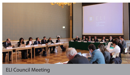
ELI Council Meeting

For the first time this year, Members of the ELI Council convened in Vienna in the Palais Trautson