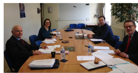
Members of the Working Group on Structure

exchanged their views on the scope of the rules and definitions and reached an agreement