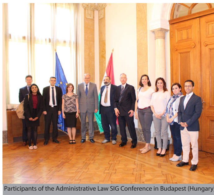
Participants of the Administrative Law SIG Conference in Budapest (Hungary)