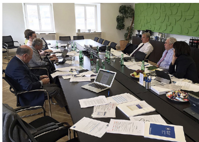
Project team during the meeting in Vienna (Austria)

During the meeting, the results of the first consultation with stakeholders were analysed. The team also further developed two out of three planned outputs of the Project – namely Output 1: A Draft Statement of European Best Practice in Relation to the Approach that Courts and Judges Should Adopt in Interacting with all Types of ADR Processes and Output 3 Draft Recommendations as to the Best European Models that can be Developed and Applied for Coherent Access to DRPs in Respect of Different Types of Dispute, and Towards Which Member States may wish to Progress. The Team decided that the relevant stakeholders will be further consulted in this regard. The Team also agreed that the next meeting will be held during the ELI Annual Conference on 7