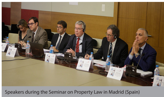
Speakers during the Seminar on Property Law in Madrid (Spain)

Further details can be found on our website .