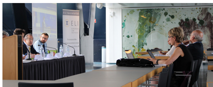
Participants during the inaugural workshop in Vienna (Austria)