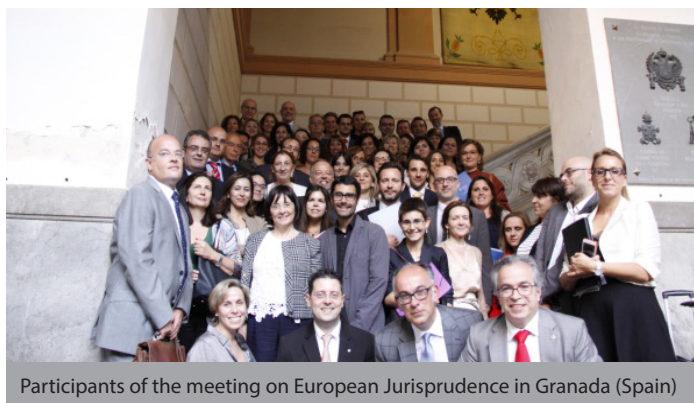
Participants of the meeting on European Jurisprudence in Granada (Spain)

On 9 May 2017, the Spanish Hub came together for its second meeting, which took place in Granada (Spain). The event was organised by the University Carlos III in collaboration with the University of Münster. Presentations on international law, the CJEU and the ECtHR were given.