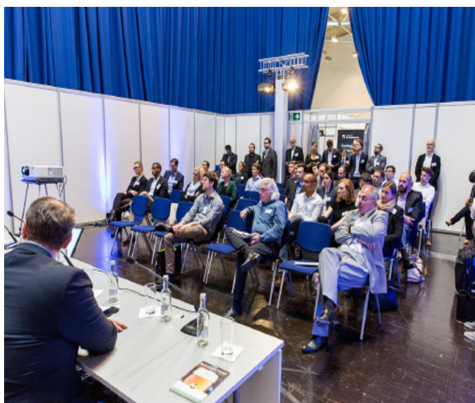
in Essen (Germany) 2017