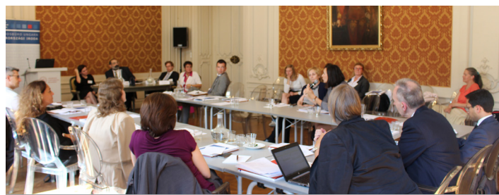
Presentation during the Administrative Law SIG Conference

As announced in the March/April Newsletter, a more detailed report on the ELI 'Dispute Resolution' SIG is available on our website .