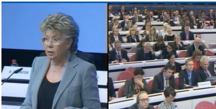
Viviane Reding, the Assises de la Justice