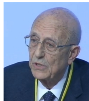
Sabino Cassese