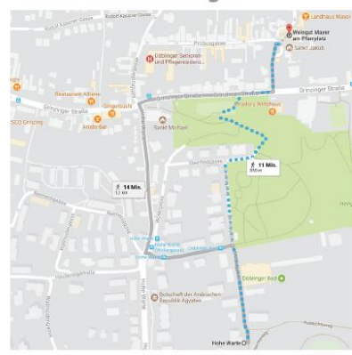
Walking route from 'Wien Hohe Warte' to the Heuriger