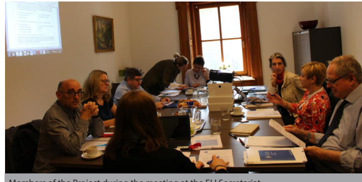
Members of the Project during the meeting at the ELI Secretariat

upcoming Annual Conference in Riga (Latvia). Find out more about this Project here.