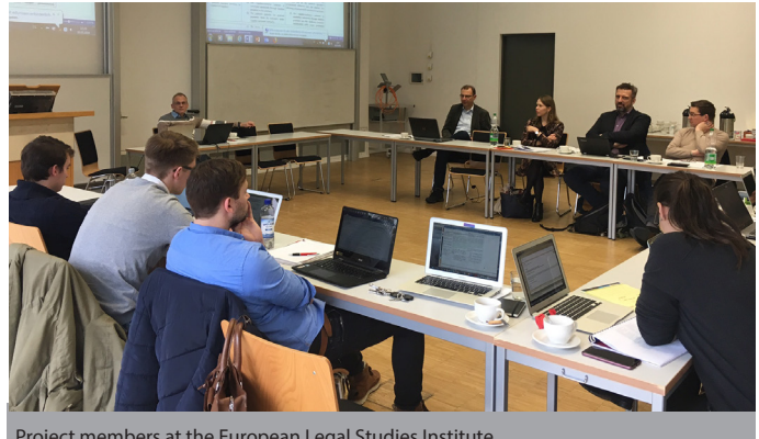
Project members at the European Legal Studies Institute

The main focus of the meeting was set on the coordination of the draft and structure of liability rules alongside the scope of the instrument and the platformsupplier relations.