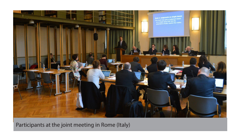
The meeting constitutes the first joint event by the ELI and UNIDROIT this year and will be followed by at least two more public Project-related events in 2018.

It comes after a Parties Working Group meeting in