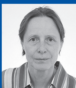
Ksenija Turković Judge and Vice-President of the European Court of Human Rights (ECtHR)