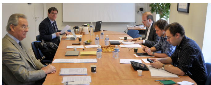
Meeting of the Working Group 'Obligations of parties, lawyers and judges'