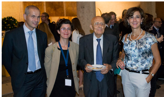
Marta Cartabia at the ELI Annual Conference 2016

on 9 September, noting the importance of the ELI as a network of experts representing different legal traditions, which enables valuable exchange of experiences about the strongest parts of the respective national systems.