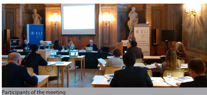
Participants of the meeting

On 21-22 November, the Members of the ELI-UNIDROIT Project 'From Transnational Principles to European Rules of Civil Procedure' met in a remarkably captivating building on the premises of Palais Trautson in Vienna. The meeting was kindly hosted by the Federal Ministry of Justice of Austria, and its aim was to discuss the advanced drafts of the three initial Project Working Groups (WG), 'Access to information and evidence', 'Service and due notice of proceedings', and 'Provisional and protective