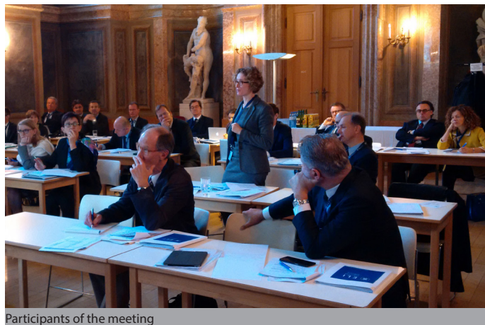
Participants of the meeting

draft set of rules, which focus around such topics as: general provisions on evidence, presentation, management and evaluation of evidence; access to evidence orders; and finally, types of evidence.