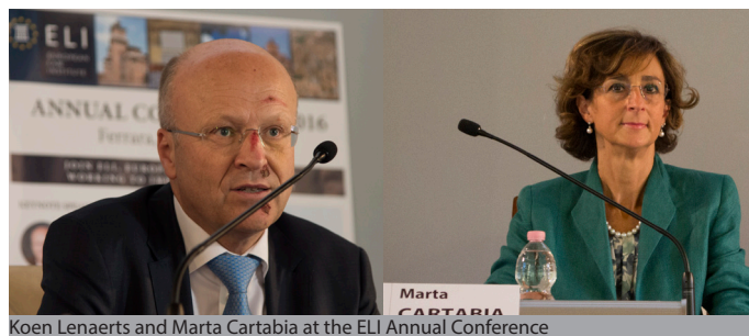
Koen Lenaerts and Marta Cartabia at the ELI Annual Conference

Marta Cartabia, Vice-President of the Italian Constitutional Court, gave a keynote lecture during the opening ceremony, highlighting the importance of including a broad spectrum of people in the legal domain, especially young people.