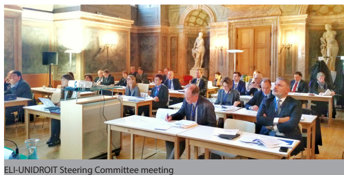
ELI-UNIDROIT Steering Committee meeting

Experts working on the ELI-UNIDROIT Joint Project 'From Transnational Principles to European Rules of Civil Procedure' were also kept busy in 2016, with several meetings of the Working Groups and Steering Committee. At the ELI Annual Conference, two panel discussions were dedicated to this Project. The Steering Committee of the ELI-UNIDROIT