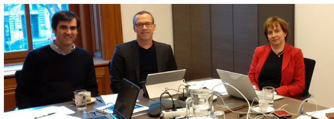
Meeting of the Working Group 'Access to information and evidence'