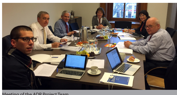
Meeting of the ADR Project Team

At the meeting, the team worked on a joint position paper of the ELI and ENCJ, titled: The Relationship between Formal and Informal Justice: the Courts and Alternative Dispute Resolution. The aim of the work is to consider the concerns that have arisen as a result of the exponential growth of numerous different forms of ADR in Europe. In particular, thought needs to be given to the interaction between ADR processes and court-based dispute resolution processes, so that the two can work together as seamlessly as possible.