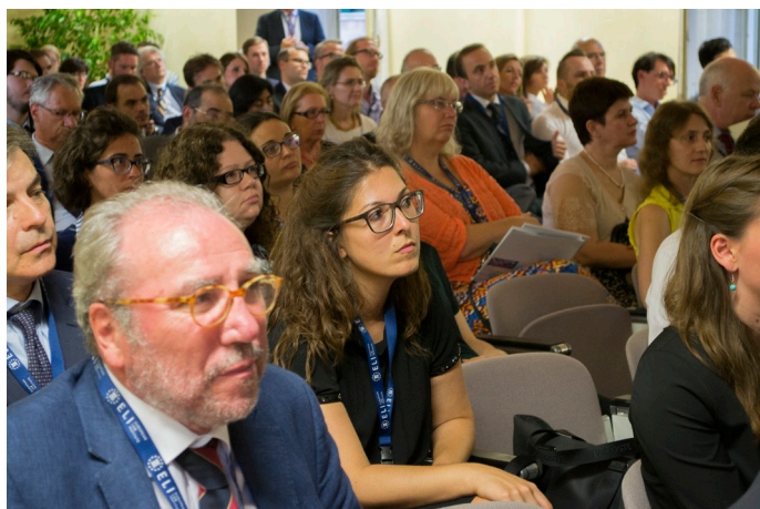
Participants of the ELI Annual Conference, Ferrara 2016

Koen Lenaerts, President of the Court of the European Union, gave an inspiring keynote lecture