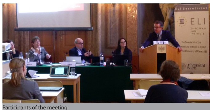
Participants of the meeting

The meeting was chaired by the Steering Committee of the Project, and was attended by the Members and Co-Reporters of all the Working Groups, as well as Observers and Advisers of the Project, Representatives of the European Commission, European Parliament, the Council of Bars and Law Societies of Europe, the Hague Conference on Private International Law, Members of the UNIDROIT Governing Council, private practitioners, and academics. The event greatly benefited from the valuable remarks and comments from the participating experts.