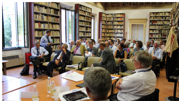
ELI Council meeting in Ferrara, September 2016

Special Interest Groups (SIGs) were created in late 2015. 2016 was an active year for SIGs with meetings and conferences organised. Further, members of SIGs were also able to meet as part of the Annual Conference programme in Ferrara.