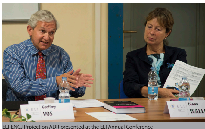
ELI-ENCJ Project on ADR presented at the ELI Annual Conference